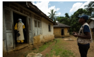
Surviving Ebola is just the first challenge facing the residents of Liberia, like those in Mawa town pictured here, as well as Guinea and Sierra Leone.

Ebola's arrival has only worsened the prospects for controlling other entrenched tropical diseases, such as Lassa fever and malaria .